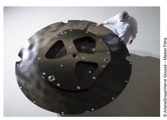
Ultra-light satellite antenna reflector.

It complements its offering with a range of products for scientific, Earth observation and telecommunications satellites (compact antennas, antenna reflectors, etc.).