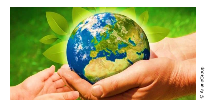
In 2018, ArianeGroup's efforts in this area focused on:

The goal of the DfE team is to promote an overall vision of the product and process life-cycle by taking terrestrial and orbital ecosystems into account and to guide design choices to reduce their environmental footprint.