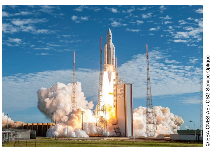
Ariane 5 is the epitome of European space expertise.

ArianeGroup is lead contractor for Europe's Ariane launchers, as well as for the missiles of the French oceanic deterrent force. Its activities cover the entire life-cycle of a space launcher, from design to development, production, operation and marketing, through its subsidiary Arianespace. ArianeGroup produces and operates the Ariane 5 launcher and develops the future Ariane 6 launcher, for which it is authority. ArianeGroup desian and Subsidiaries design innovative, highly competitive solutions for civil and military launch systems and space applications for their institutional, commercial and industrial customers. The Group is thus expert in the most cutting-edge technologies, from all aspects of complete propulsion systems right down to the items of equipment and materials.